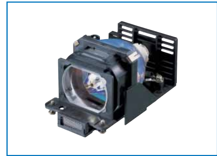
LMP-C150 Replacement Lamp